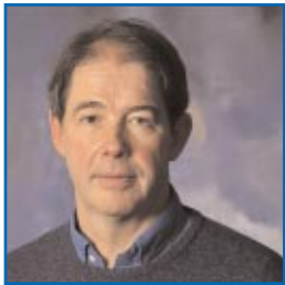
Jonathon Porritt CBE