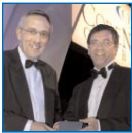
2006 Executive of the Year