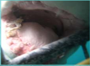
Great white shark dive not to be forgotten & In the cage—hearts beating.

Cape Town is such a great city - it was great to return to after our flying Christmas visit to London , Hamble & Dublin . Good food , good wine and great company . Not to mention cage diving with great white sharks , A fantastic new years ever party down on the waterfront and the endless hospitality of the Royal Cape Yacht Club—who were the host club for the Heineken Cape to Bahia race - (the old Cape to Rio race) - everyone likes a drinks sponsor when it comes to pre race parties .The value of the rand makes South Africa such an attractive country—and the place where we had the most consistent good food