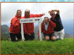
877 steps—takes 45 mins to climb or 5 mins in a taxi

For the 5000 islanders the only way on and off is by the twice monthly “ Royal Mail Ship” which goes to and from Cape Town . Jamestown the main port is like the set of the 60’s TV program Heartbeat , half days Wednesday , closed for lunch , and very quaint architecture with all the modern conveniences - including the least likely requirement of an island society—Traffic Wardens ! - We loved the island and enjoyed eating in 2 of the 3 restaurants that is has - but St Helena will never be a mainstream tourist spot—the big local debate is whether or not the British Government should fork our for the cost of an Airport for the Island - me thinks Gordon Brown has better things to do with £1Billion!