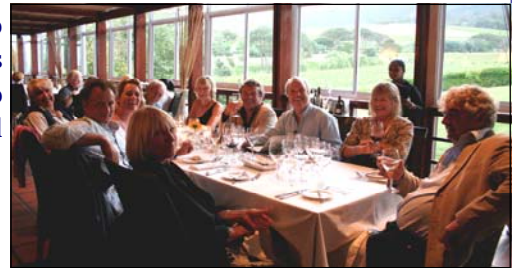
Dinner for 10 at Buitenverwachting vineyard, Constantia

As part of the trip it was great to be able to meet up with old friends , and catch up on gaps of too many years - we are grateful the generous hosts who opened the doors to us - half expecting to be receiving weather beaten , smelly sailors and were presently surprised