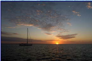
K8 at Sunset