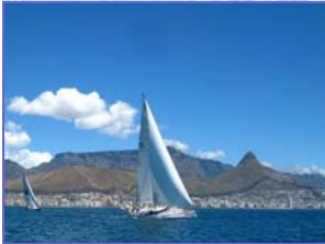
Start Line Cape Town another fantastic sunset